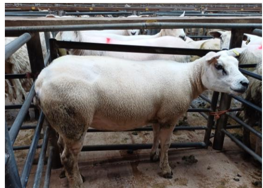
Top Price Ewe

Please ensure all VAN numbers are available when booking in your sheep